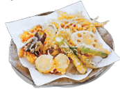
Assorted vegetable tempura

Depending on dishes, food may be served out of order. Thank you for your understanding.