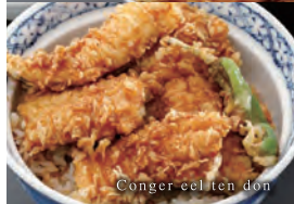
Conger eel ten don