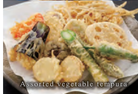
Assorted vegetable tempura