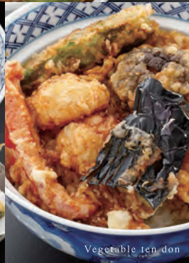
Vegetable ten don