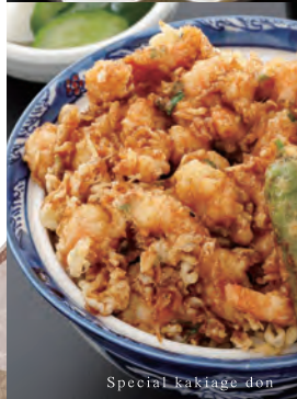
Special Kakiage don